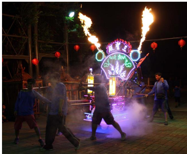
Pyrotechnics at the local temple on Penghu.

Does it sound idyllic, even "islandly idyllic"? If you missed out on this one, do not despair. ISISA's next conference "Islands of the World XIII" will be held 22-27 September 2014 on Penghu. Another chance to leave your heart in Taiwan.