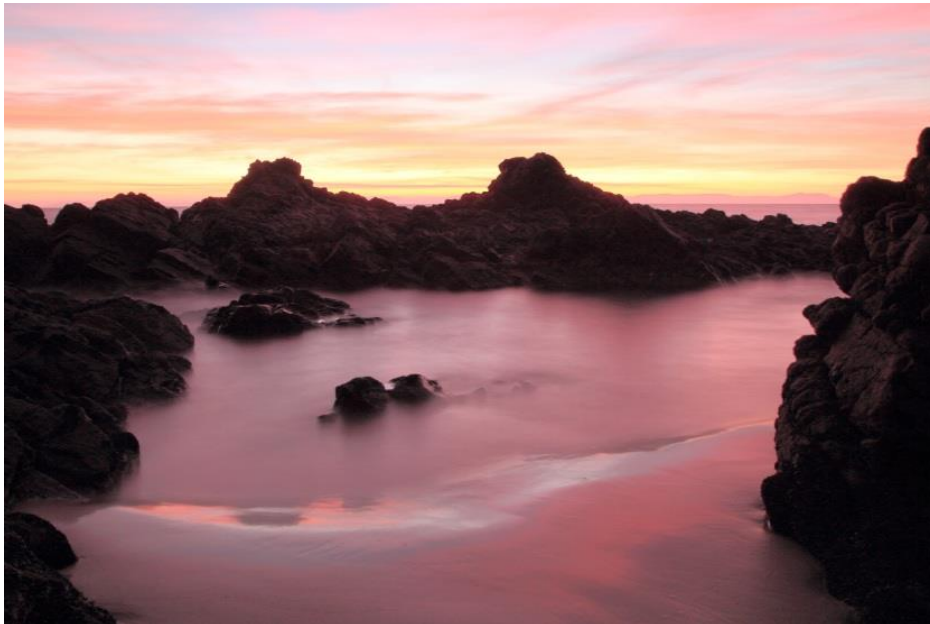
Plate 1. Sunrise, Bruny Island